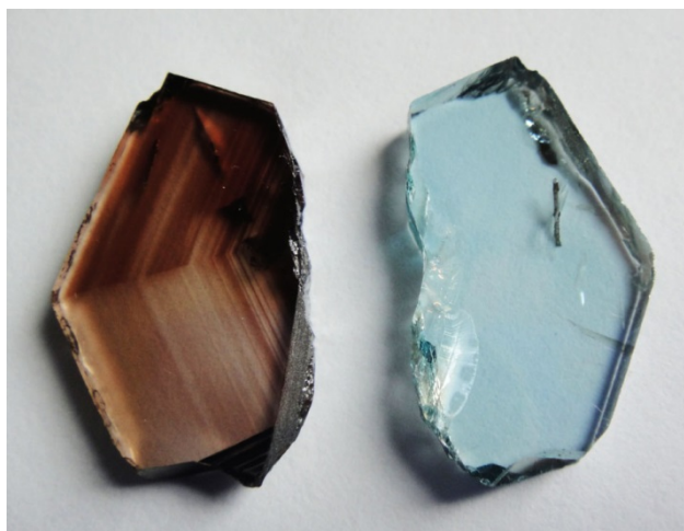
Fig. 1. Image of a cut, gem-quality zircon specimen (size 17 mm). The right half was subjected to heat-treatment whereas the left half is in its initial state.

We have studied a series of large, gem-quality specimens that were first crystallographically oriented on a four-circle X-ray diffractometer. Specimens were cut in half along the crystallographic c-axis. One half was then subjected to heat treatment whereas the second half was left in its original state. Both halves were then prepared as doubly polished sections. This enabled us to analyse chemically end texturally equivalent specimens with matching faces, hence providing direct comparability of untreated (brown) and treated (blue) material.